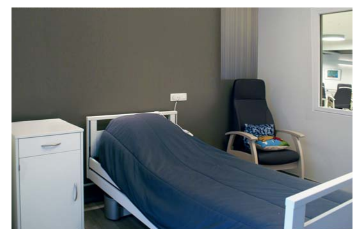
Anima Care was established in 2007 and currently operates more than 11 retirement and nursing homes with over 1,100 beds.